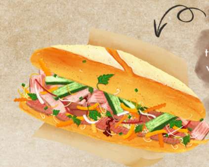
Bánh Mì Bánh mì sandwich typically contains green vegetables and various fillings, including pate and commonly pork.