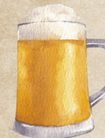
Bia Hơi Local draft beer (bia hơi) is popular and inexpensive.