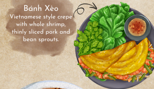
Bánh Xèo Vietnamese style crepe with whole shrimp, thinly sliced pork and bean sprouts.