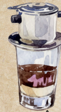
Cà Phê Sữa Đá Cà phê sữa đá is iced coffee served with sweetened condensed milk.