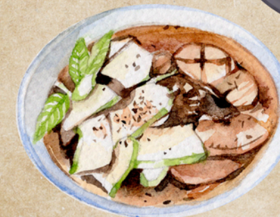
Bún Chả Bún chả is served with grilled fatty pork over a plate of white rice noodles and herbs with a side dish of dipping sauce.